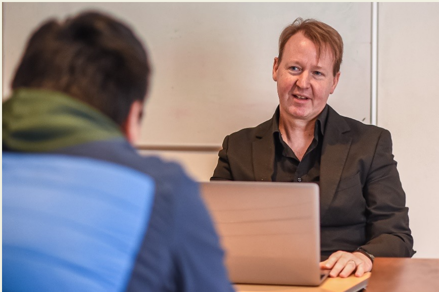
Greene's College Oxford, Oxford, Oxfordshire, One-to-one tuition, fostering independency, and preparing your child for university.