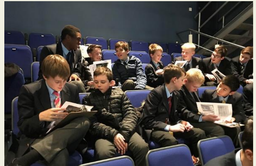
Abingdon Senior School, Abingdon, Oxfordshire, Larger classes.