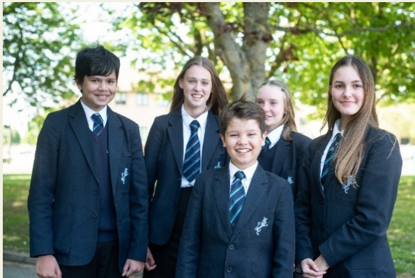
Burford School, Oxford, Oxfordshire, Admits children of all genders.