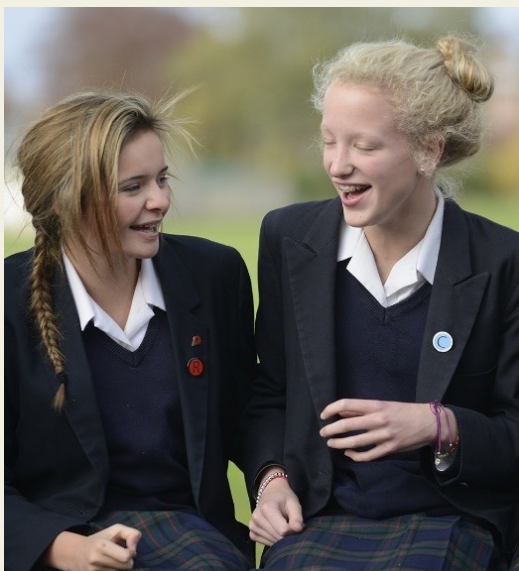
Wrekin College, Wellington, Shropshire, Admits 11+