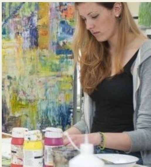
Brampton College, Hendon, London, Specialist in Art.