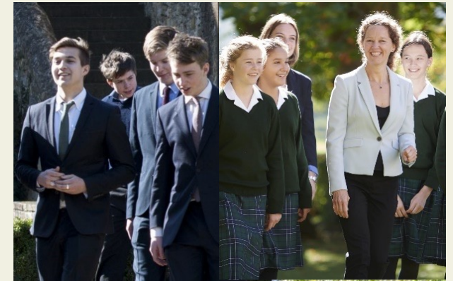
Sherborne School (boys)/ Sherborne Girls' School, Sherborne, Dorset, Admits to different schools, depending on gender.