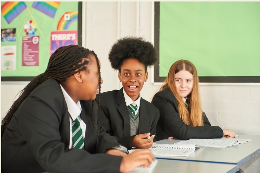
Fulham Cross Academy, Fulham London, State school.