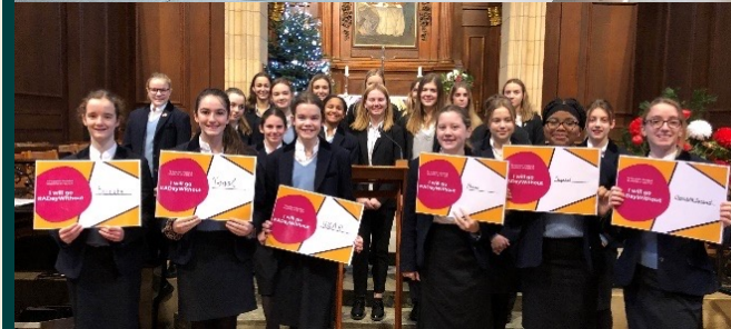
Stowe School, Stowe, Buckinghamshire