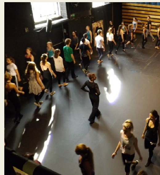
Hurtwood House, Dorking, Surrey, Drama & music specialist.