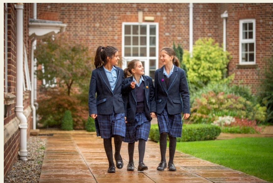
Headington Girls' School, Offers GCSEs, IGCSEs, and A levels.