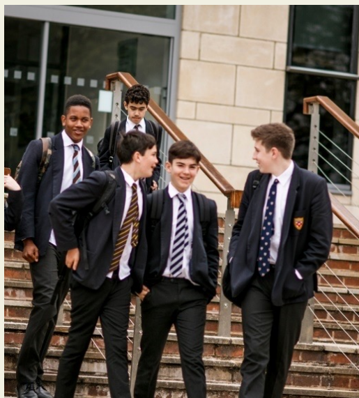
Mill Hill International, Hill, London, Admits 13+