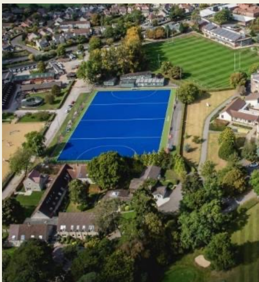
Millfield School, Street, Somerset, Renowned sports facilities.