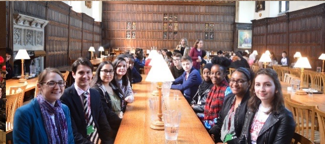
Magdalen College School, Oxford, Oxfordshire