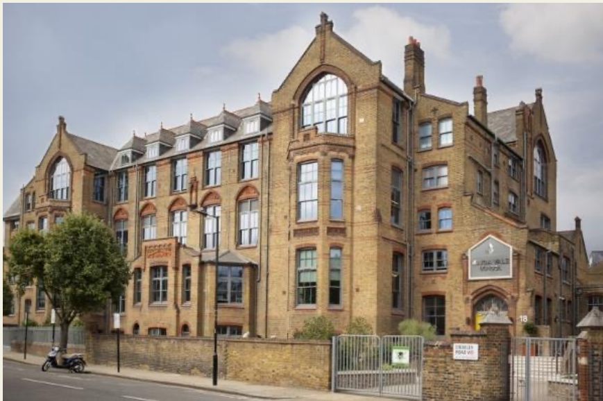
Maida Vale School, London, Urban environment.