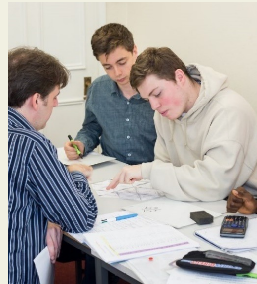
Bath Academy, Bath, Avon, Admits 15+