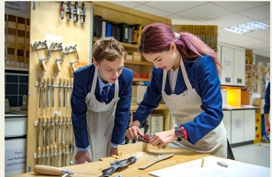
Fairley House School, Westminster, London, Day boarding only.