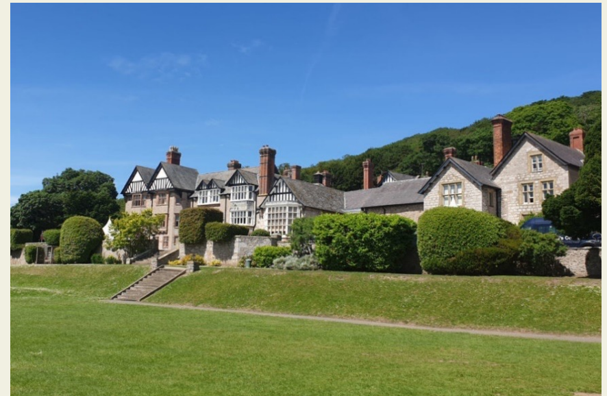
St. David's College, Llandudno, North Wales, Rural environment.