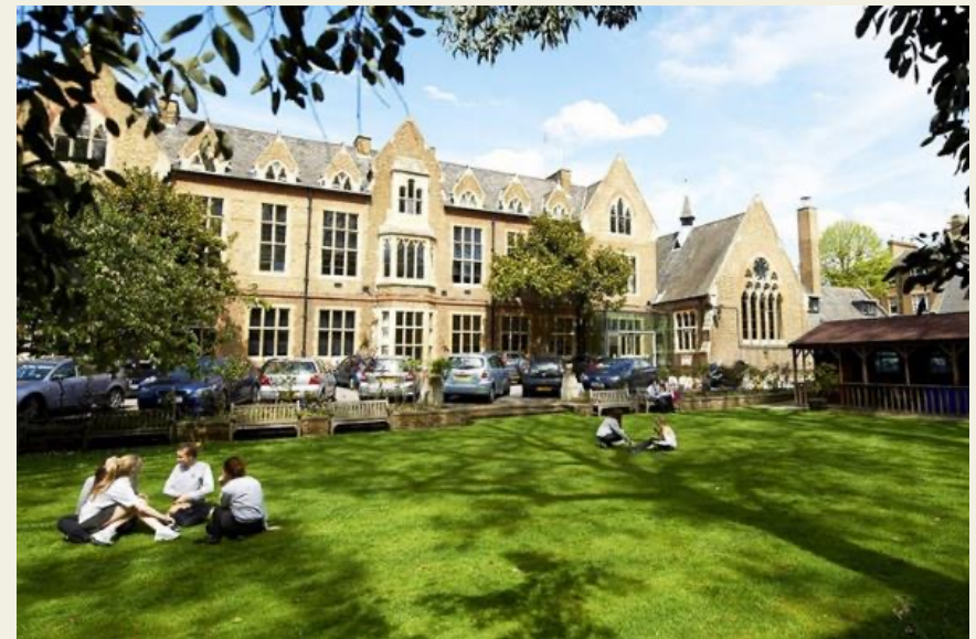
Godolphin and Latymer School, Hammersmith, London, Independent school.