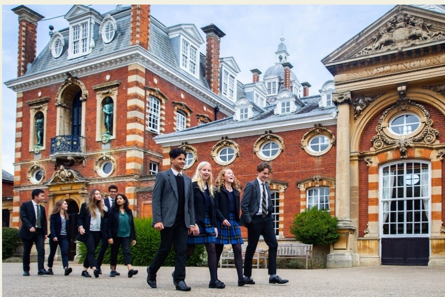
Wellington College, Crowthorne, Berkshire, Offers GCSEs, A levels, and the I.B.