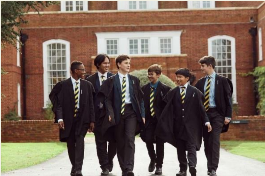
Radley College, Abingdon, Oxfordshire, Full boarding.